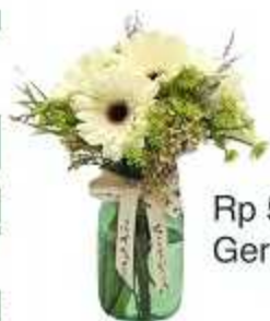
Rp 500.000 Gerbera in a Jar