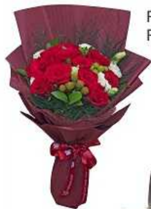
Rp 990.000 Roses are Red