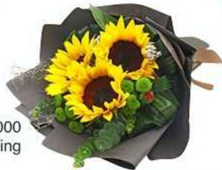
Rp 990.000 Sunflower Shining