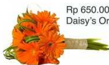
Rp 650.000 Daisy's Orange