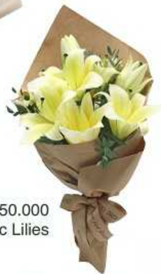
Rp 1.250.000 Rustic Lilies