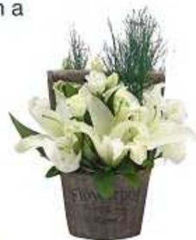
Rp 990.000 Bucket Lilies