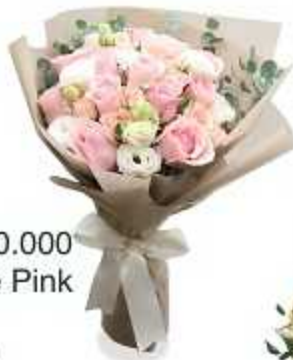
Rp 990.000 Roses are Pink