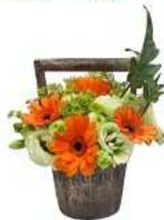
Rp 800.000 Gerbera in a Bucket