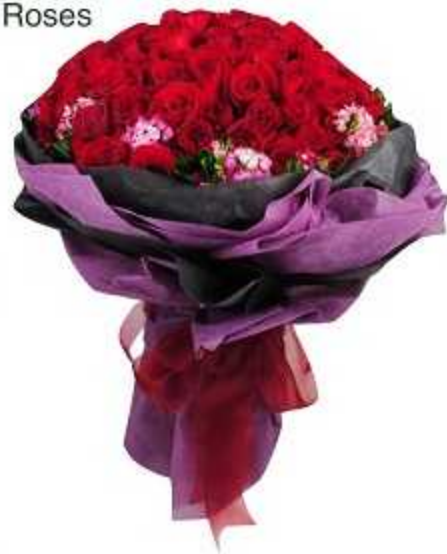
Rp 2.990.000 99 Roses

[Top up the difference for bouquets ranged above Rp 990.000]